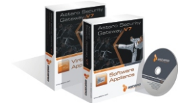
Astaro Software & Virtual Appliances