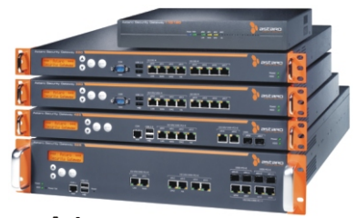
Astaro Hardware Appliances

► Astaro Virtual Appliance: Ready-to-go, certified VMware Ready virtual machines help you in adopting virtualization