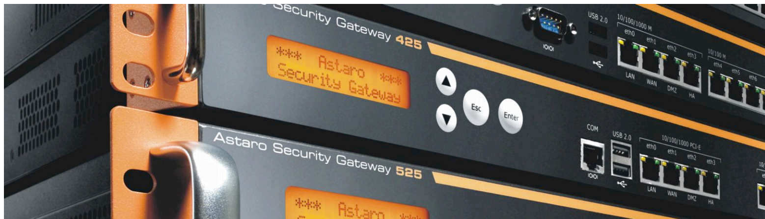
Astaro Security Gateway