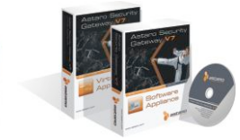
Small to large networks