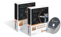
Astaro Software & Virtual Appliances